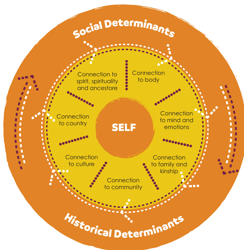
Figure 1: Social and Emotional Wellbeing Framework depicting the interplay of social and historical determinants (Gee et al. 2014)

Figure 1 above shows that “the SEWB of individuals, families and communities are shaped by connections to body, mind and emotions, family and kinship, community, culture, land and spirituality...” (Gee et al. 2014 p. 58). This SEWB paradigm, based on an Indigenous holistic conception of health and wellbeing where the social, emotional and cultural wellbeing of the whole community comprises a distinct set of wellbeing domains and principles, and culturally informed practices that “differ in important ways with how the term is understood and used within Western health discourse” (Gee et al. 2014 p.57).